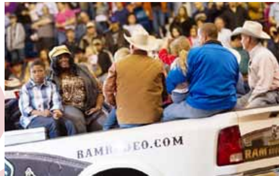
2011 Miracle Kids at the San Angelo Rodeo