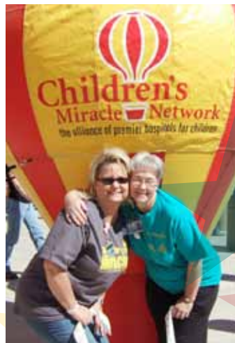
2008 Volunteers at Rodeo Day