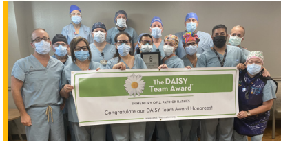
Daisy Team Award Cardiac Cath Lab July Winner