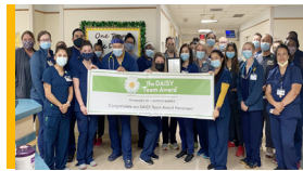
Daisy Team Award 5 South April Winner