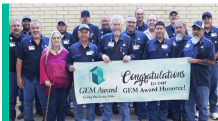
GEM Team Award Engineering Department - Downtown January Winner