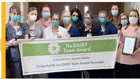
Daisy Team Award Skilled Nursing April Winner