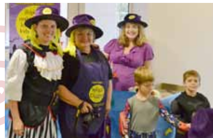
2011 Spirit Halloween Costume Party

through the Women's & Children's unit and I've seen all the plaques on pieces of equipment- on rocking chairs, on doors that say 'paid for by Children's Miracle Network.' During the first Radiothon we raised $27,000 and we proudly are boasting a total of $163,000 from our tenth event." Shannon's pediatricians and nursing staff play a huge role in CMN. Their talent and expertise, combined with the $1.18 million in new equipment funded by CMN, have saved numerous local children and their families from making long trips to receive treatment at other facilities.