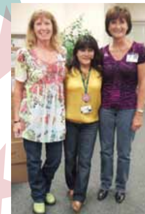
2010 Miracle Jeans Day

Hardworking staff, generous volunteers and outstanding support from the community have helped Children's Miracle Network and Shannon Medical Center's relationship blossom. The achievements of the last decade are great, but CMN aims to reach even larger goals. There will be other children and families who need help and CMN will be here to help them along their journey.